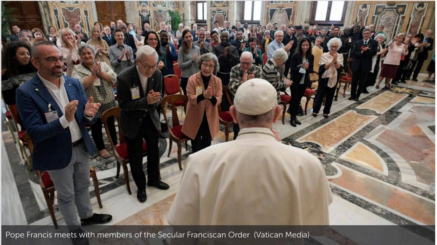
Pope Francis meets with members of the Secular Franciscan Order