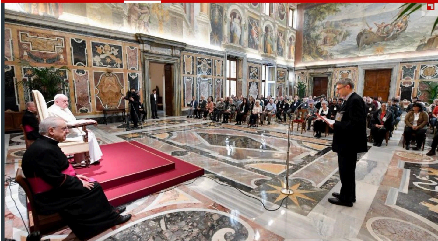
Minister General Tibor Kauser, OFS, addresses Pope Francis.