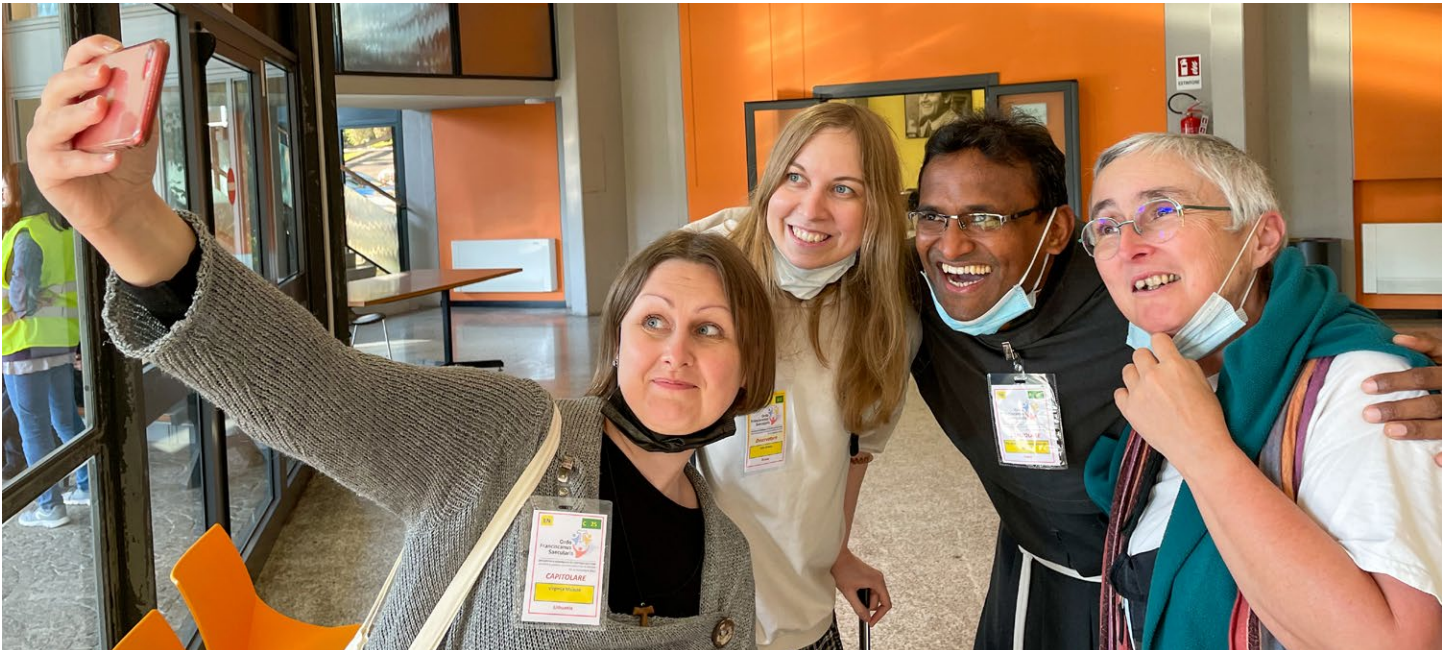
There were many selfie moments as delegates and observers arrived at the General Chapter.

The delegates who comprise the International Council of the OFS (CIOFS) meet every three years, and every six years elect new servant leaders to serve on the Presidency (or international executive council). Because of the pandemic, the outgoing Presidency's term went from six years to seven.