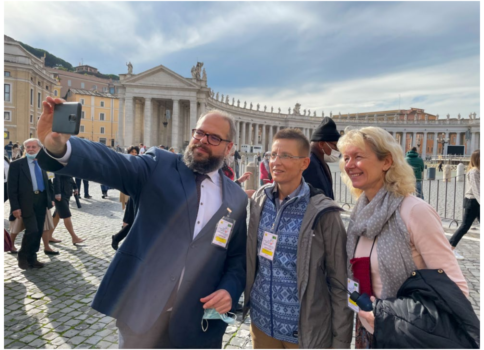
Chapter participants were constantly snapping pictures inside and outside the Vatican on the day they had an audience with Pope Francis. The only place they were not allowed to take photos was during their time with the pope, where the Vatican photographer took official photos.